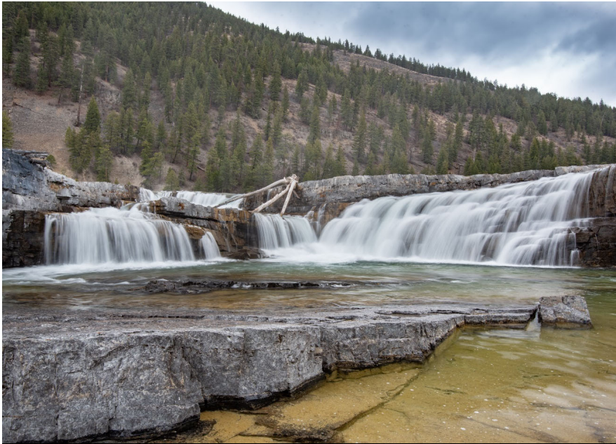
Kootenai Falls Date of Photo, March 29, 2021

Bonneville Power Administration U.S. Bureau of Reclamation U.S. Army Corps of Engineers